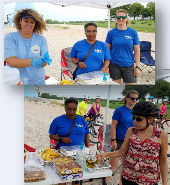
Fun moments at the 2018 ride.